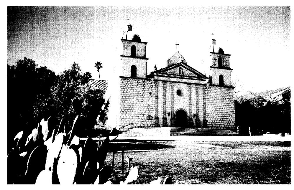
Santa Barbara, California