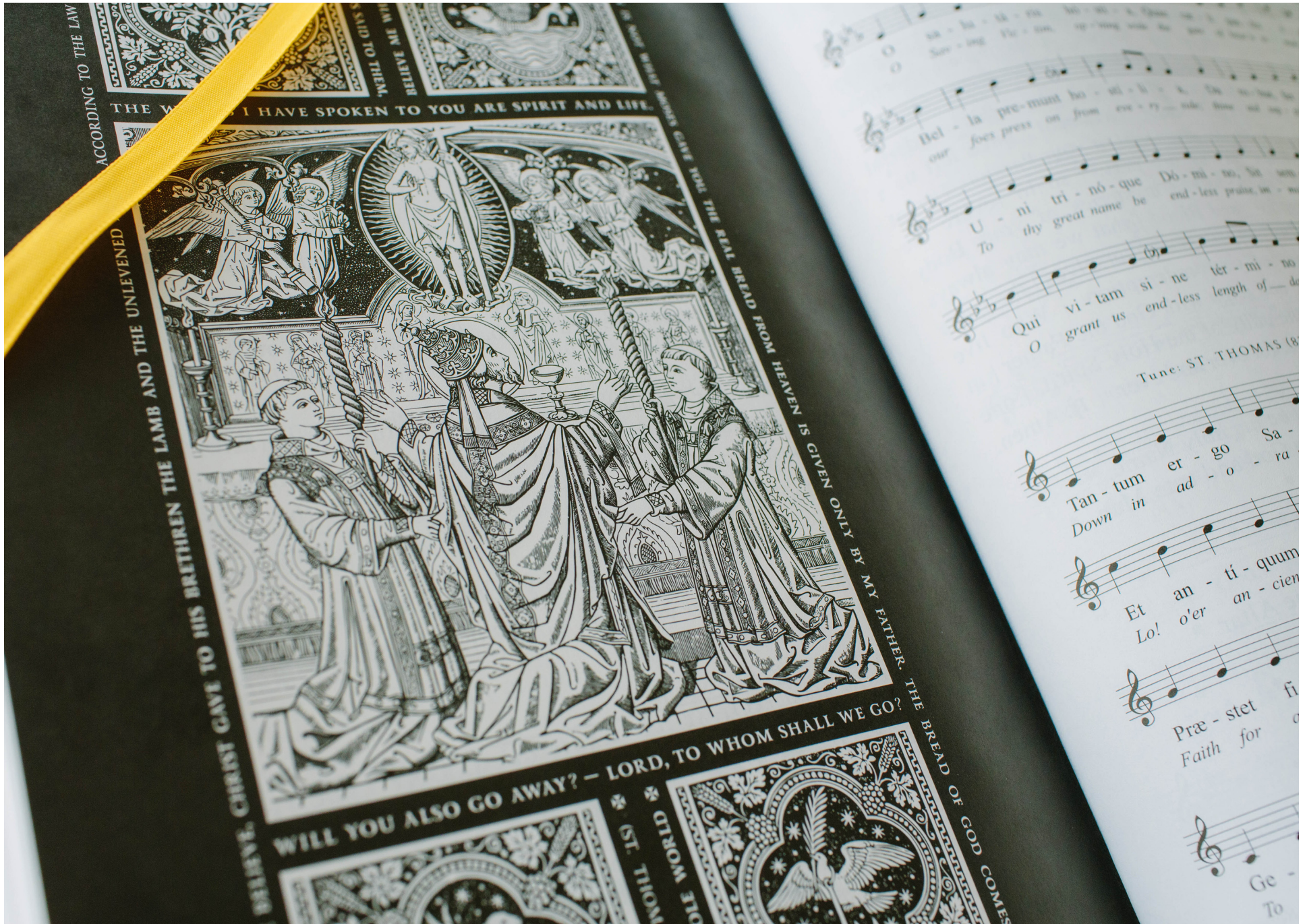
Help your congregation better appreciate the Mass: CCWATERSHED.ORG/JOGUES