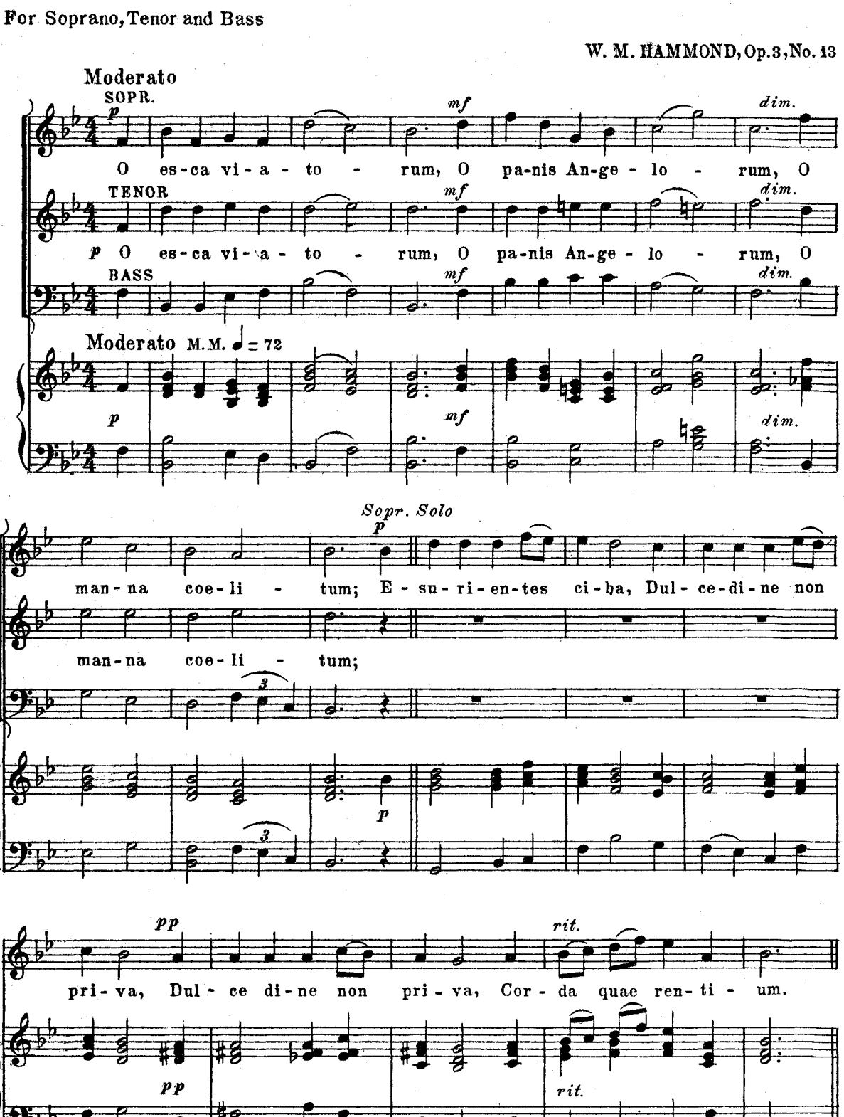
Copyright MCMXXXV by McLaughlin & Reilly Co., Boston In The Caecilia Dec. 1935