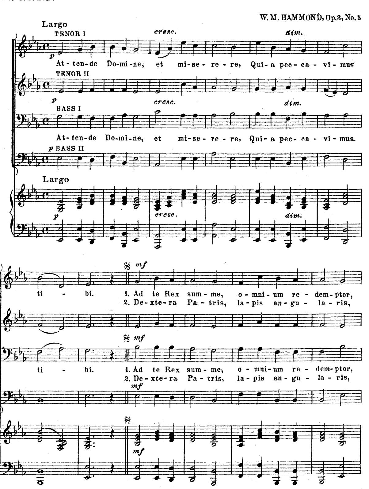
Copyright MCMXXXV by McLaughlin & Reilly Co., Boston In The Caecilia (Dec. 1935)