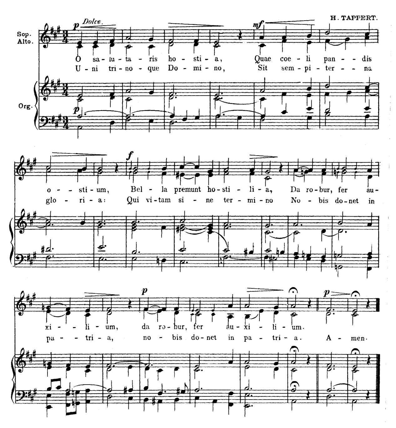
M. & R. Co. 432-12