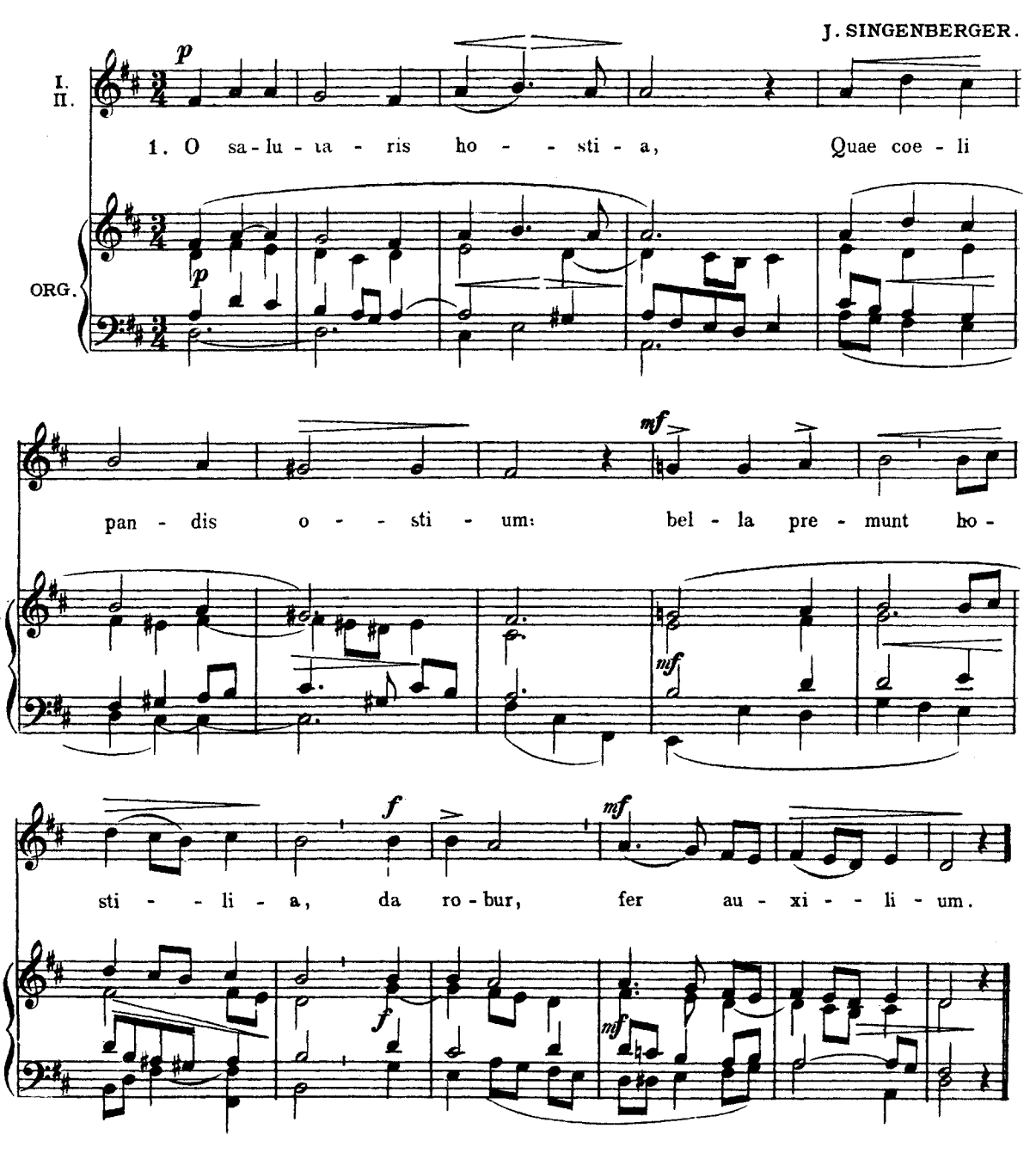
M. & R. Co. 432-12