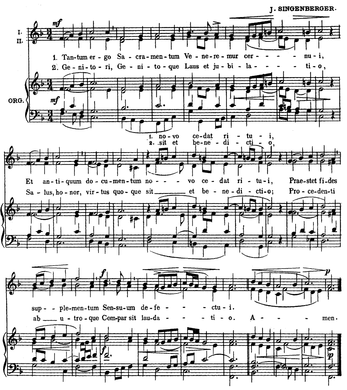
M. & R. Co. 432-12