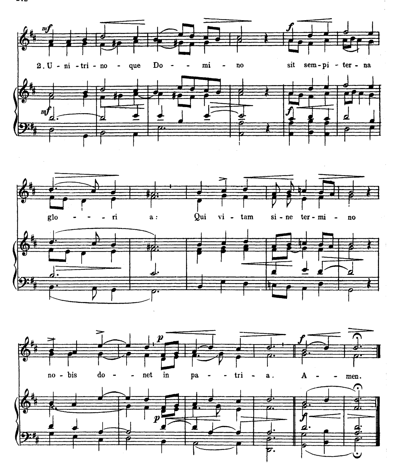
M. & R. Co. 432-12