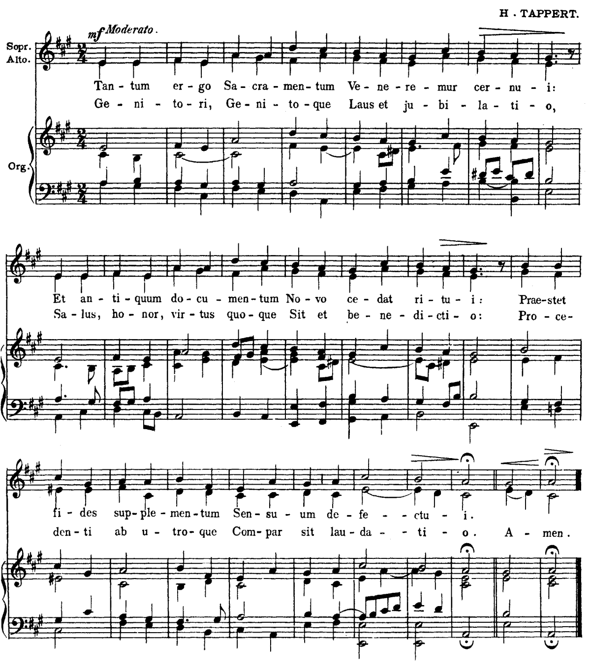
M. & R. Co. 432-12