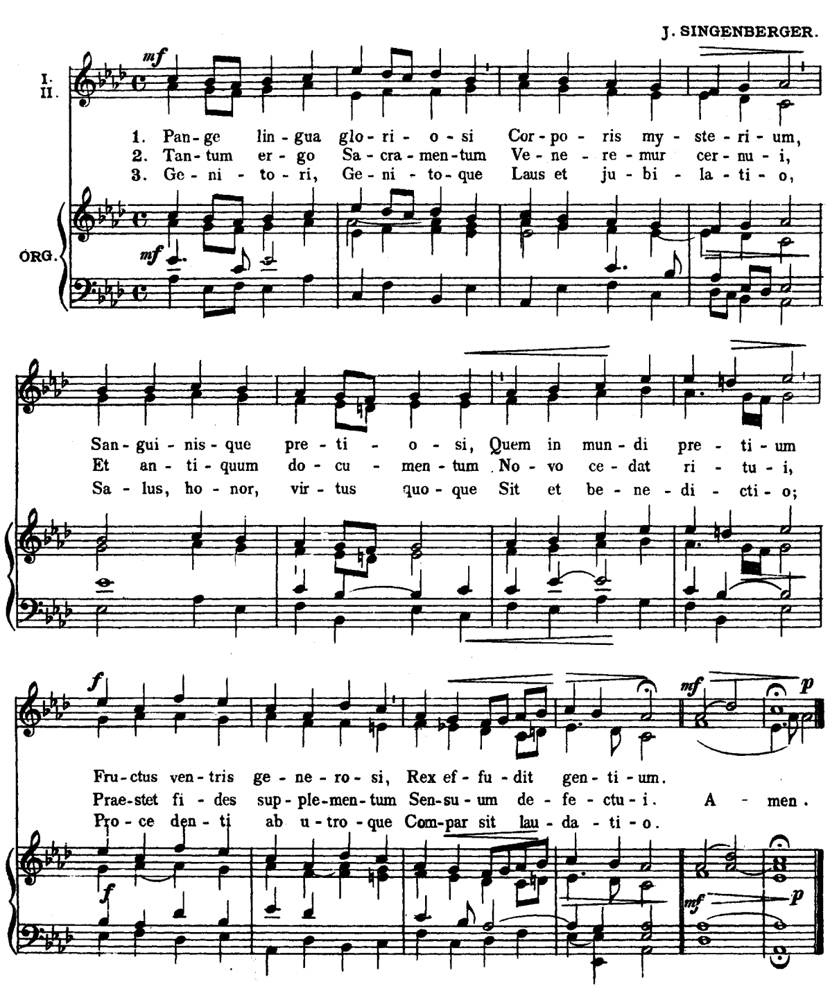
M. & R. Co. 432-12