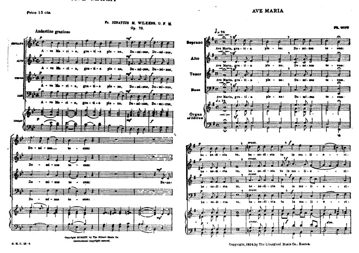
Two Motets from the McLAUGHLIN & REILLY CO., Edition