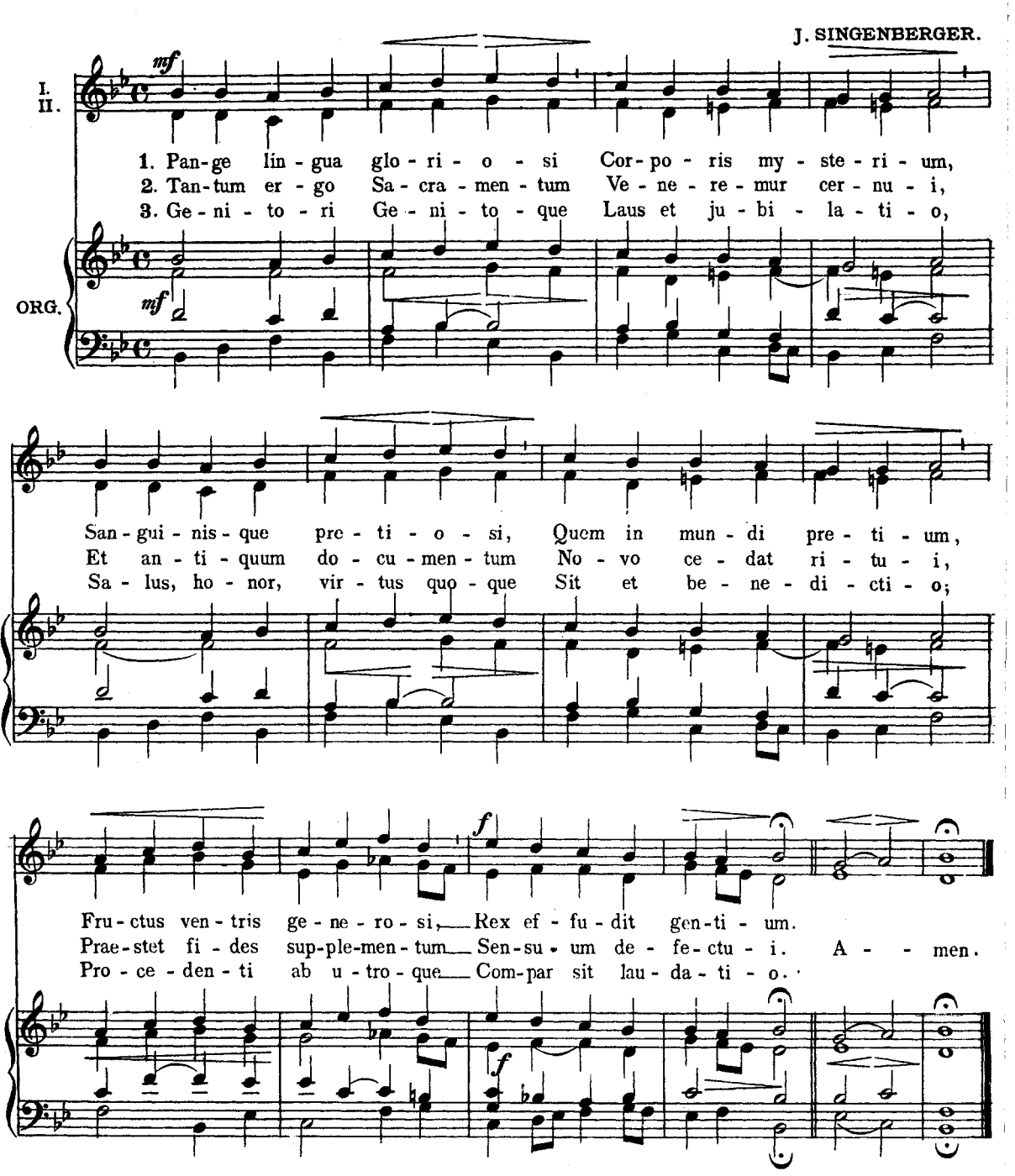
M. & R. Co. 432-12