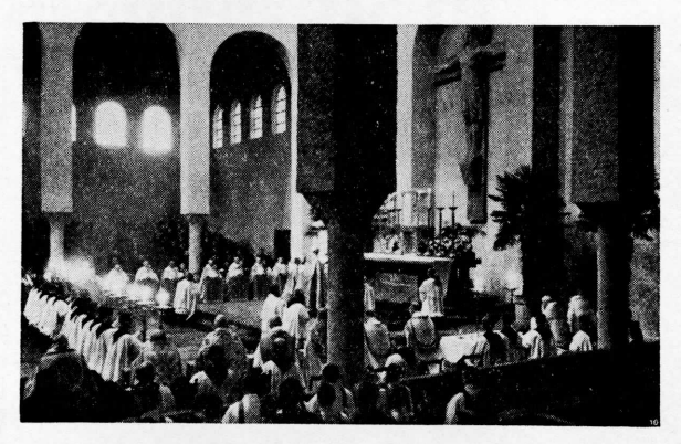
Consecration of the Fifteen Altars

As the procession drew near to the church, pathetic strains of music were heard. Surely it brought to many a heart the revelation of how all earthly struggles, fought manfully for Christ, find their glorious reward in heaven. Years before, in some far distant land, the holy martyrs had submitted to the executioners. Now Bishops and monks and a multitude of the faithful, in solemn procession, paid them homage as their patrons and heavenly protectors.