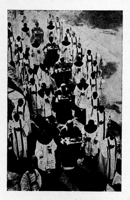
The Solemn Rites

the choir of the monks, aids them in chanting the Divine Office; and six bells in one of the four towers call the people to the service of God. Artistic statues of the Saints adorn both the facade and the interior of the church.