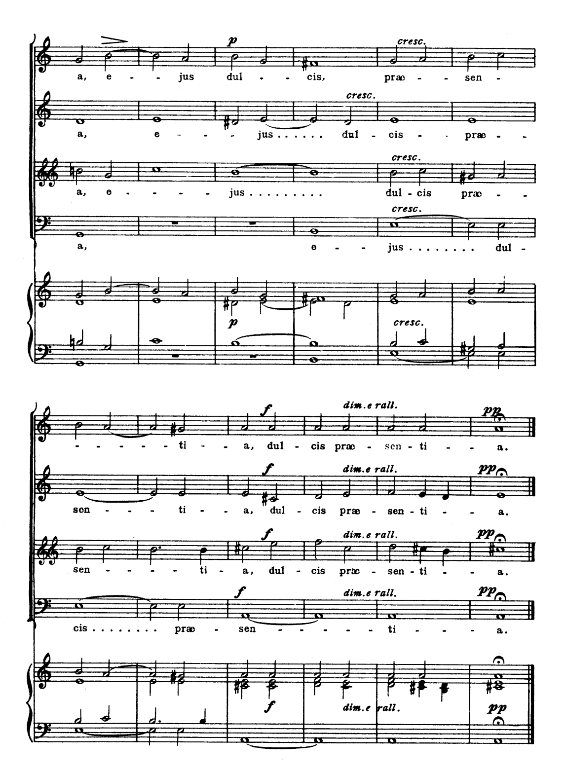
M & R Co. 1055-3