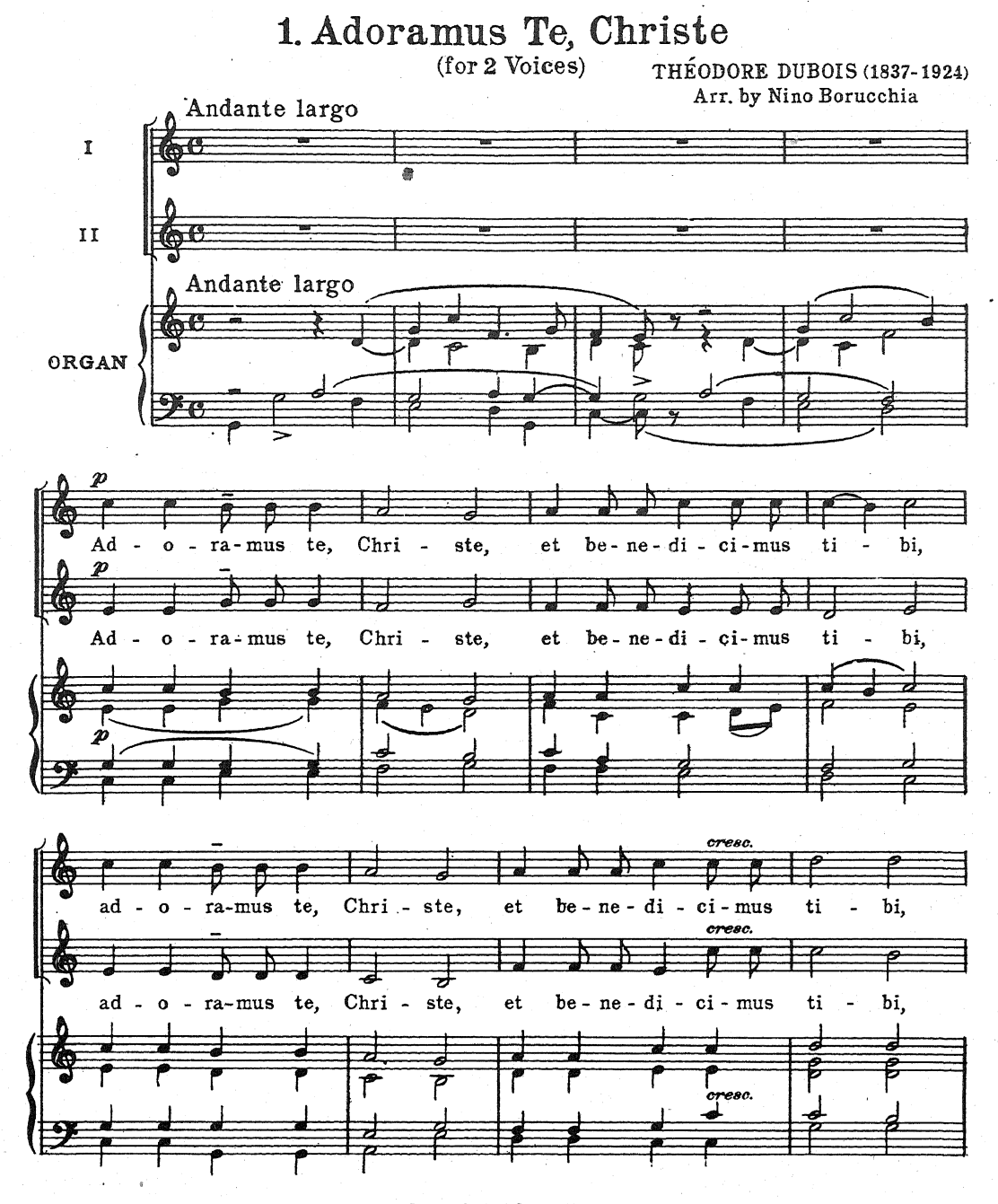
M. & R. Co. 1266-4