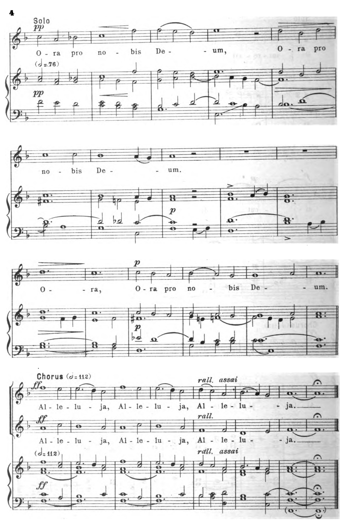
B.M.Co. 5712 c