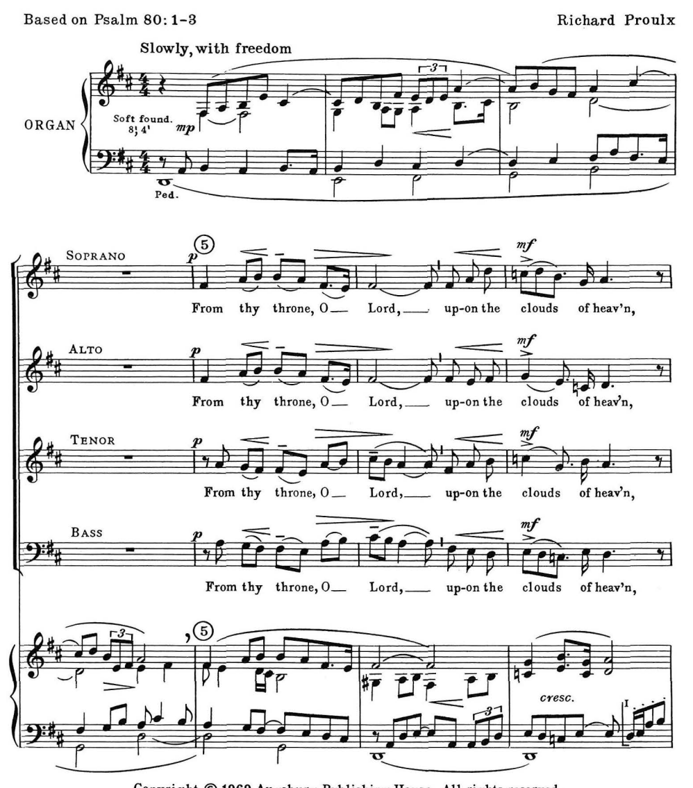
Copyright © 1969 Augsburg Publishing House. All rights reserved. Printed in the U.S.A. International copyright secured.

Reprinted in Sacred Music with permission.