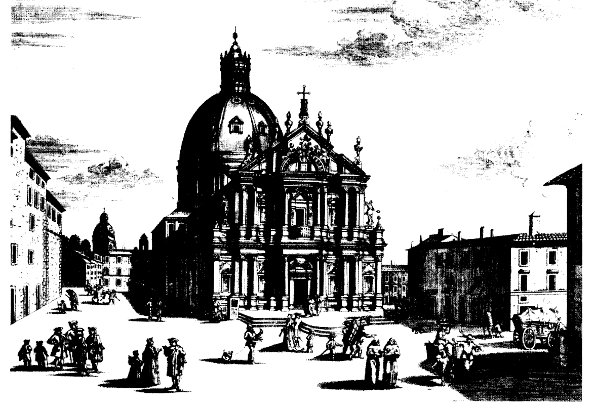
Rome. Sant' Andrea della Valle