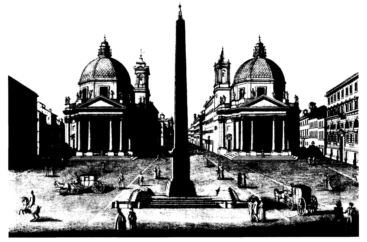
Rome. Piazza del Popolo