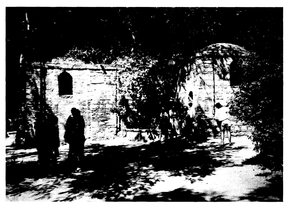
Ephesus. House of Mary