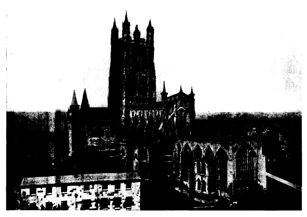
View From Southeast. Cathedral, Gloucester Gothic (Perpendicular). Rebuilt 1329—C. 1450