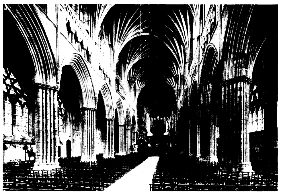
Nave, Looking East. Cathedral, Exeter Gothic. 1270—13.9