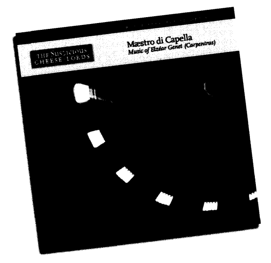
To purchase CDs online, and for more information, visit www.cheeselords.org.