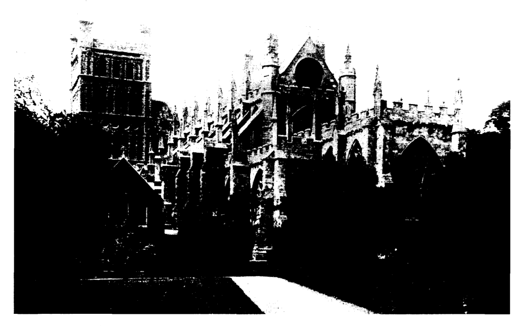
East End. Cathedral, Exeter Mainly Gothic. 1270—1369. Towers Norman. XII Cent.