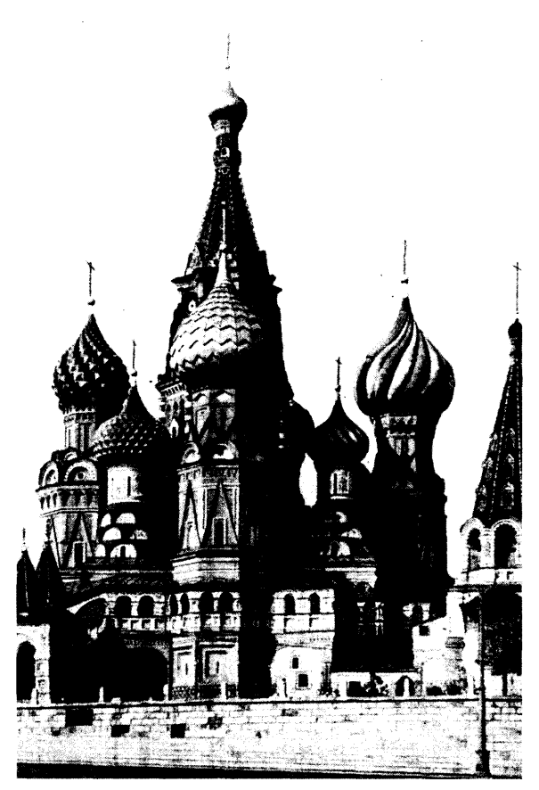
Cathedral of St. Basil the Blessed. Moscow Byzantine. 1554—60, and later. Architects, Barma, Posnik