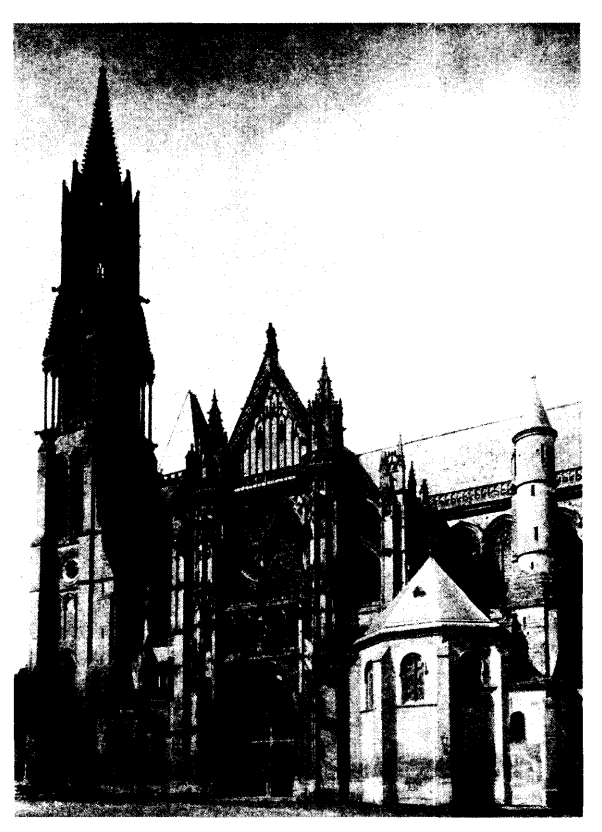
View from South. Cathedral, senlis Gothic. XII-XIII and XVI Cent.